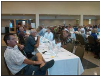
Enjoying the great dinner at the PRVVC meeting.

“The food drive was such a great success, PRVVC will continue to work with local food banks at upcoming rallies.”