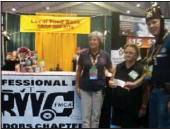
The Shriners Donated $701.