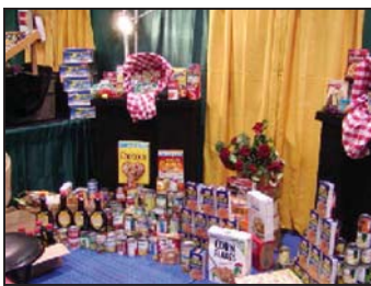
The food drive booth at Bowling Green FMCA